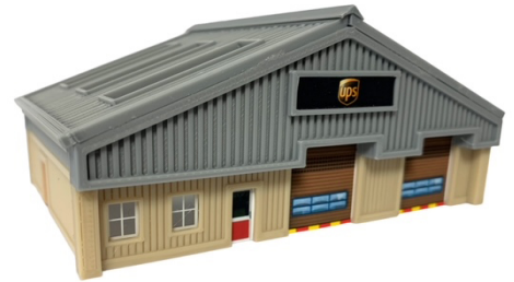
N SCALE UPS DEPOT

Thanks for purchasing one of our kits, this kit requires scissors and a GEL Glue Collall.